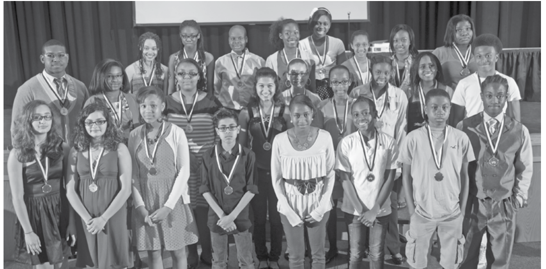
Academic Achievement Awards Recipients