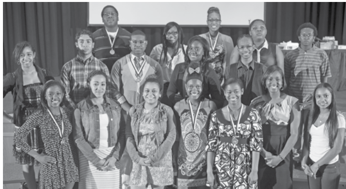
Class of 2013