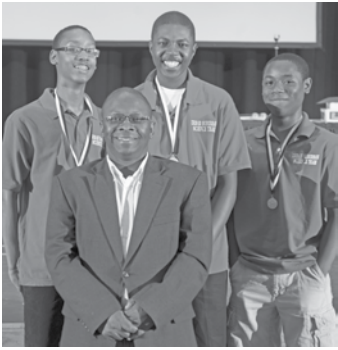
Science Bowl Team