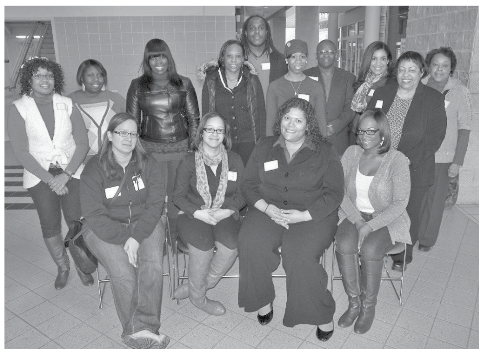
Urban-Suburban Alumni Association and volunteers