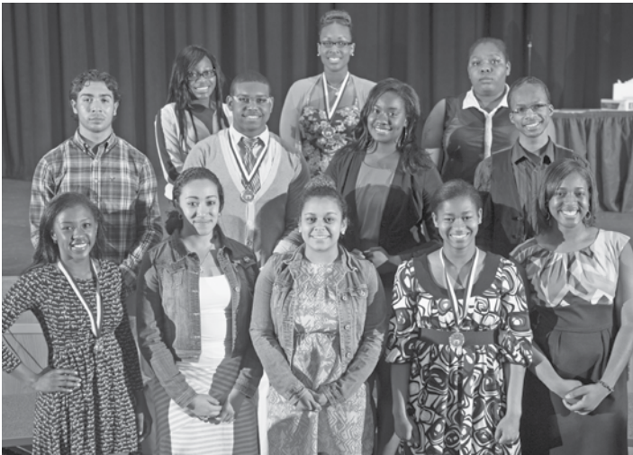
2013 Scholarship Recipients