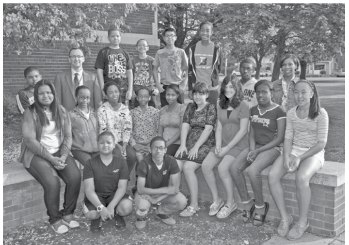
Twelve Corners Middle School Students

Keep in touch at the Urban-Suburban Program Website: